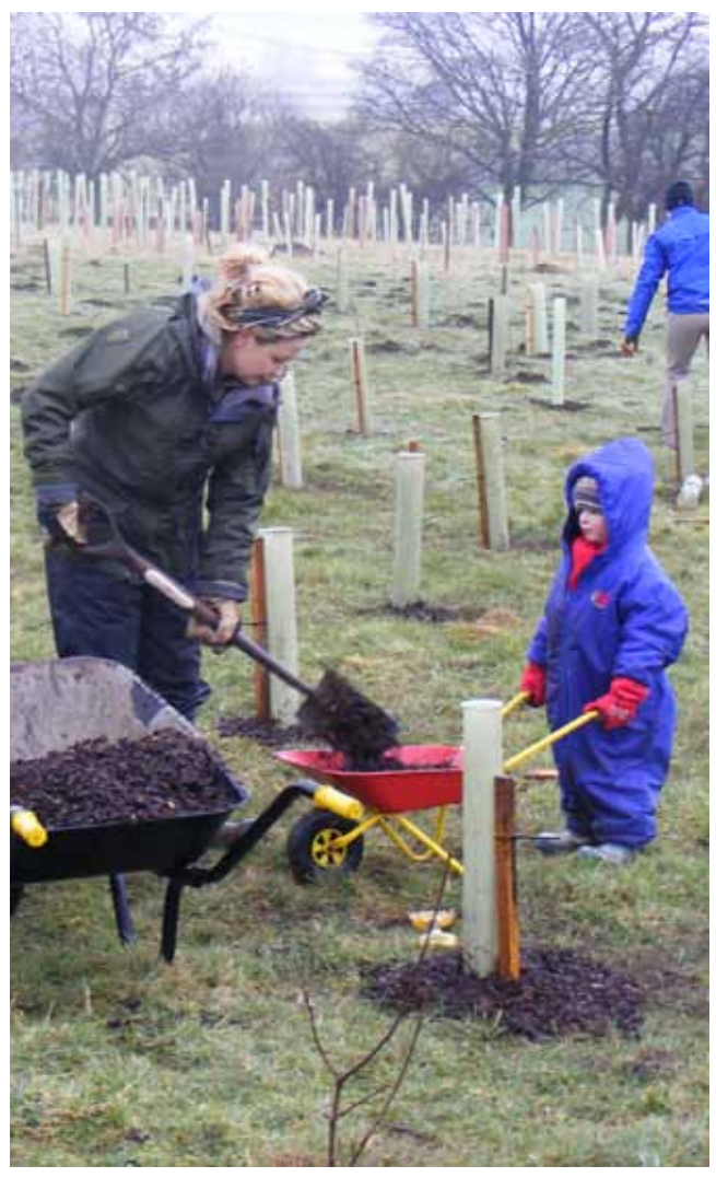
Tree planting at Orton Community Woodland

The role of a Destination Organisation (DO) is to foster these partnerships and collaborations and to support the development of the Visitor Giving network. This role might also extend to providing expertise on promoting the scheme and/or leadership on how it is developed.