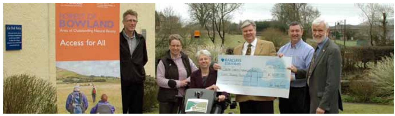
Three Fishes cheque presentation to the Forest of Bowland Tourism Rnvironment Fund

Visitor Giving creates numerous marketing opportunities for destinations and participating businesses. The Futerra guide, Sell the Sizzle and VisitEngland's Keep It Real guide demonstrate the great opportunities for selling sustainability in a lively, fun and not over preacherly way. If tourism businesses in the destination are raising money for a good cause, people would love to hear about it.